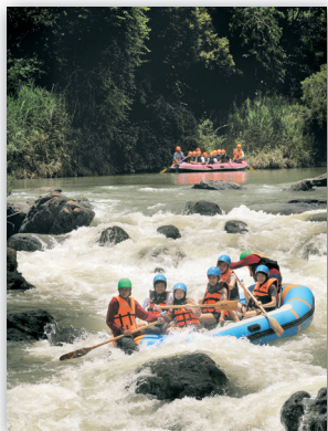
Kaeng Hin Phoeng Rafting Festival