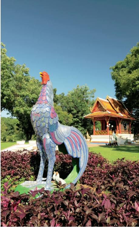
King Naresuan the Great Shrine