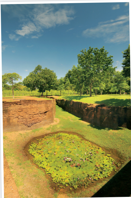
Sa Kaeo Ancient Monument

To get there: From Prachin Buri, proceed along Suwinthawong Road. Use Highway No. 319 (Prachin Buri - Phanom Sarakham route) for about 23 kilometres, then turn left and proceed for another 500 metres.