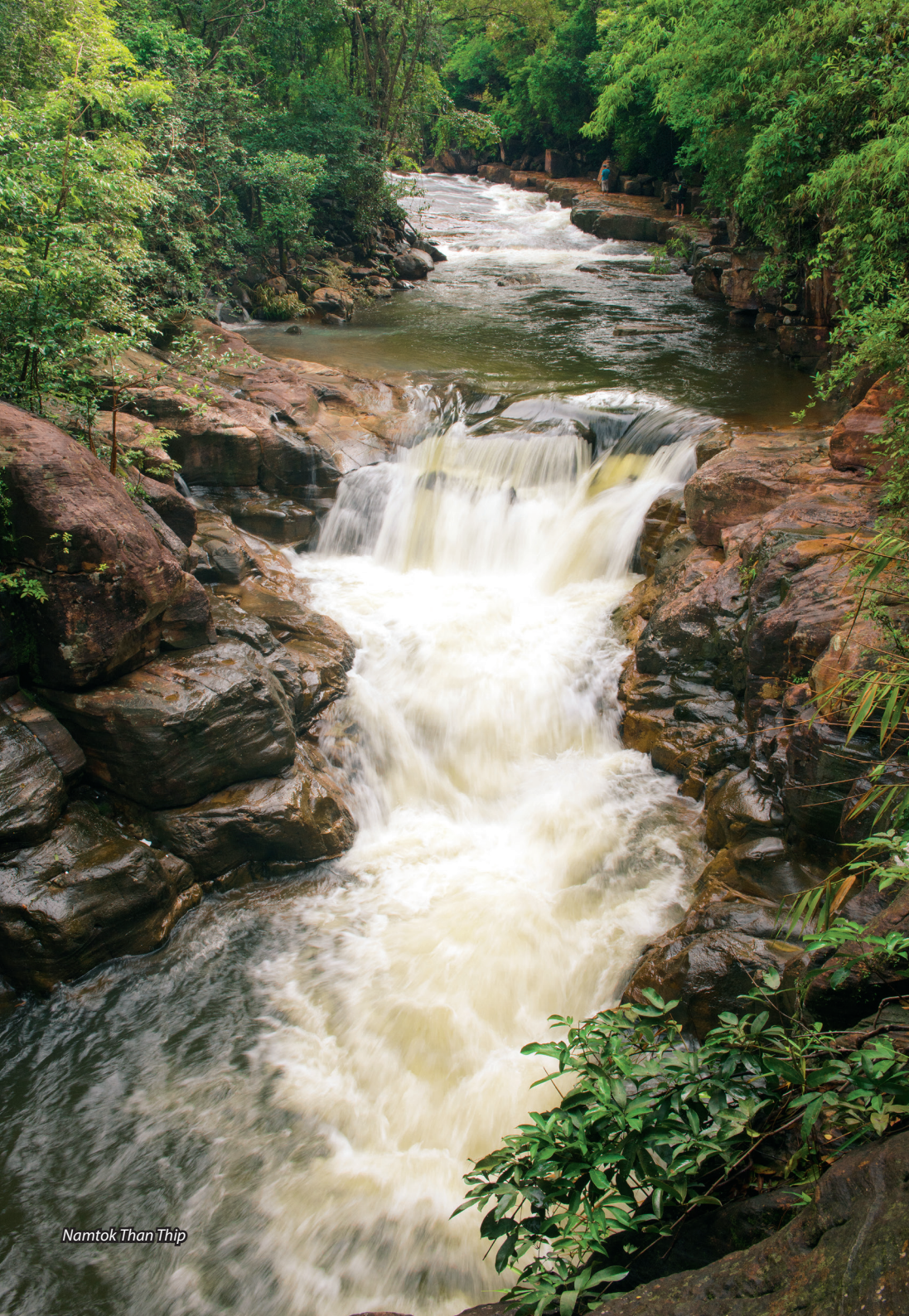
Namtok Than Thip