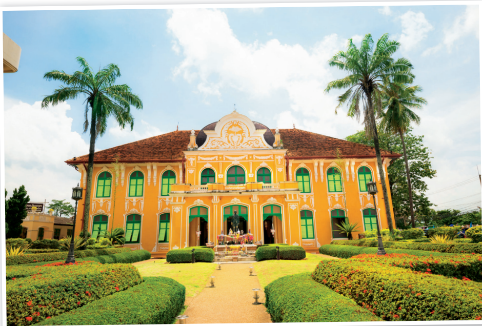
Chaophya Abhaibhubejhr Building

mostly displays important artefacts discovered from the ancient city of Mueang Si Mahosot. There are two zones; downstairs displays the archaeology of Prachin Buri, Nakhon Nayok, and special exhibitions. While upstairs displays the archaeology of Thailand, prehistory of the Eastern region, celadon found under water from Ko Khram, Chon Buri. The museum displays important artefacts discovered from ancient cities in the Dvaravati Period such as Buddha images, Hindu statues, Shiva Linga-Hindu phallic symbol of creative power, lintel, and bronze tools. Thai arts in various periods since the prehistoric until Rattanakosin period (King Rama V) are also displayed for comparative study. Moreover, temporary exhibitions on special occasions have been on display. The