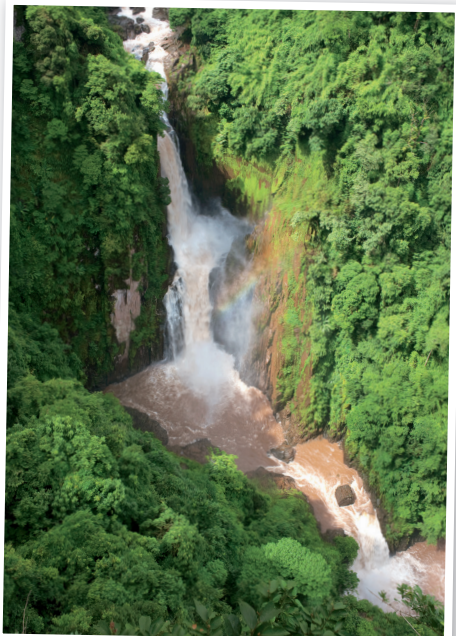
Namtok Heo Narok

Located on the Prachin Buri-Khao Yai route, Namtok Heo Narok is part of Khao Yai National