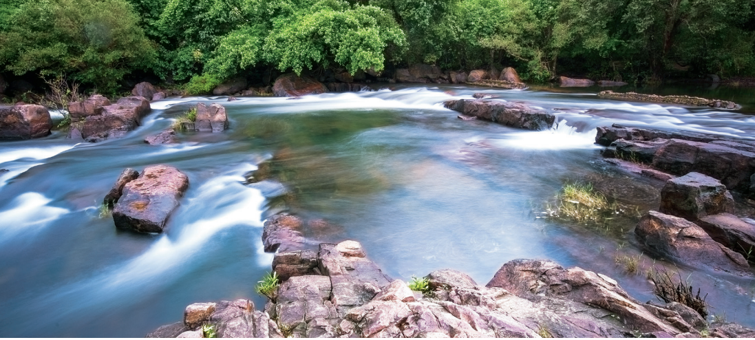
Namtok Takhro and Namtok Salat Dai

ancient remains is similar to a tray or “Phan” in Thai. Therefore, the place has been called “Phan Hin” or stone tray since. In addition, a carved round laterite base was also discovered. King Rama V paid a royal visit in 1908.