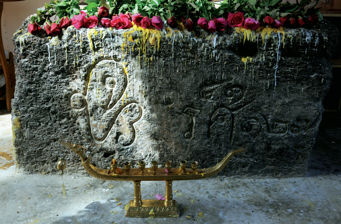
Royal Handwriting Monument

the natural laterite floor, with a stairway of 4 metres wide and some 13.60 metres long in the west leading down into the pond. It is located to the southwest of Mueang Si Mahosot. On the walls of the pond, there are bas-reliefs showing animals from myths such as elephants, Makaras, lions, pig, Kinnaree, and snake. It is believed that the water from this pond is sacred, and was used in many religious ceremonies by the kings of Mueang Si Mahosot. The pond is believed to be from the 5 th -6 th Century.