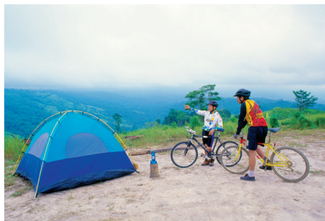
Ban Pa Ngam

It is located at Ban Thung Pho. From Bangkok, take the Rangsit-Ongkharak route via Nakhon Nayok. Turn right onto Highway No. 33 to Kabin Buri Intersection and, then, take a left turn onto Highway No. 304. At Km. 22, you will see the Suan Nongnuch sign. The trip takes about 2 hours. Occupying an area of approximately 2,000 rai, Suan Nongnuch Camping Resort, filled with a variety of flowering plants and exotic gardens, is adjacent to Khao Yai National Park. Many outdoor activities are available for tourists as well. Admission fees for adults and children are 40 and 20 Baht, respectively. Operating hours are from 06.00 a.m.-05.00 p.m., Tel. 0 3740 1371. www.suannongnuch-prachinburi.com