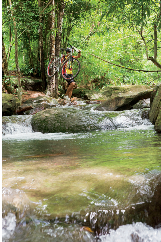
Namtok Khao Ito

This not-so-high waterfall in Tambon Ban Phra is a popular tourist attraction, which runs through rocks at different levels. Surroundings are full of timber forests. There is plenty of water only in the rainy season. The waterfall is on the same route to the Chakkraphong Dam but is 1 kilometre further.