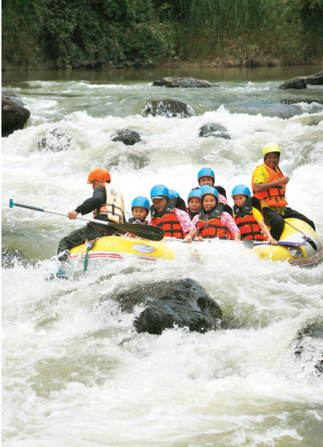
Kaeng Hin Phoeng Rafting

October at Kaeng Hin Phoeng, Khao Yai National Park Ranger Unit 9, Amphoe Na Di, includes a Kaeng Hin Phoeng rafting competition, and rafting activities with good package deals on offer. Interested persons can contact Kaeng Hin Phoeng rafting entrepreneurs or tour operators who organise rafting activities directly. Accommodation is available in the form of camp sites or resorts in Prachin Buri.