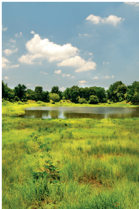
Sa Morakot Archaeological Site

under which the Lord Buddha had sat during his enlightenment. Thereafter, the branch had been planted at this Wat Ton Pho Si Maha Pho. This Pho tree has been the symbol of Prachin Buri. On Visakha Puja Day, there will be a fair to commemorate this Pho tree.