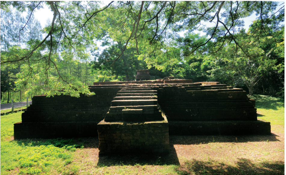
Phan Hin Ancient Monument

Situated at Ban Khok Khwang, Tambon Nong Phrong, this large square Phan Hin ancient monument is made solely of laterite. It is 15.50 metres wide on each side, and 3.5 metres high, with 4 porches. It is assumed that the building was a shrine for the Hindu God, Vishnu, built during the 7 th -9 th Century in the reign of King Jayavarman I of Chenla. The shape of a sculptural pedestal found in the centre of the