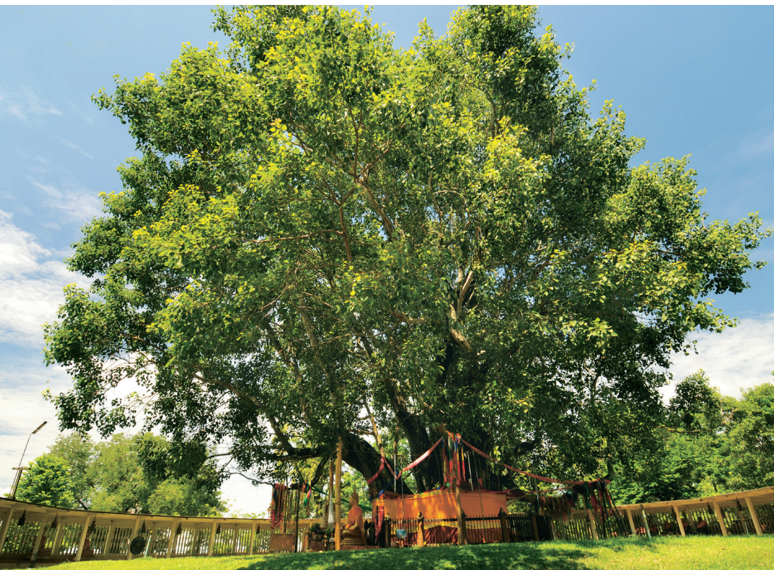
Ton Pho Si Maha Pho (The Great Bodhi Tree)

Prachin Buri Riverbank, is an example of an outstanding developed temple. The temple's highlight is Luangpho Khum, a Bang Taen local's respected Buddha image. The temple used to be a site for King Rama V's pavilion on his visit to the Prachin Buri Circle. Also, the temple houses a local museum where it collects rural tools. There is a nice view of the Prachin Buri River in the evening. Tel. 0 3729 5179.